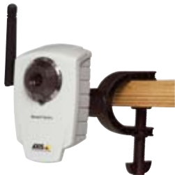
AXIS 207/207W/207MW Network Camera with flexible clamp - clamp included