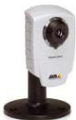
AXIS 207/207W/207MW Network Camera with camera stand - stand included